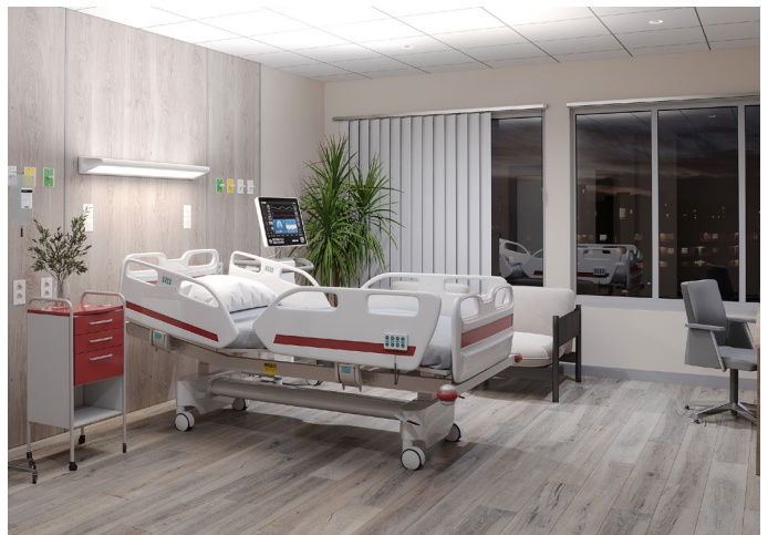
Multi-Function Headwall Luminaire