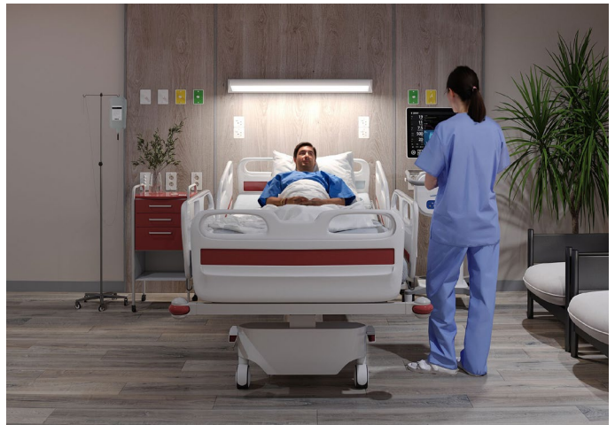
Low Glare Optical System