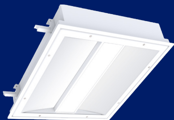
Ambient Light Mode