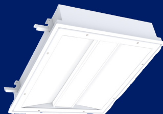
Focus / Cleanup Mode