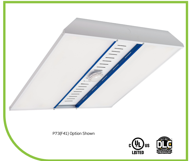
P73(F41) Option Shown